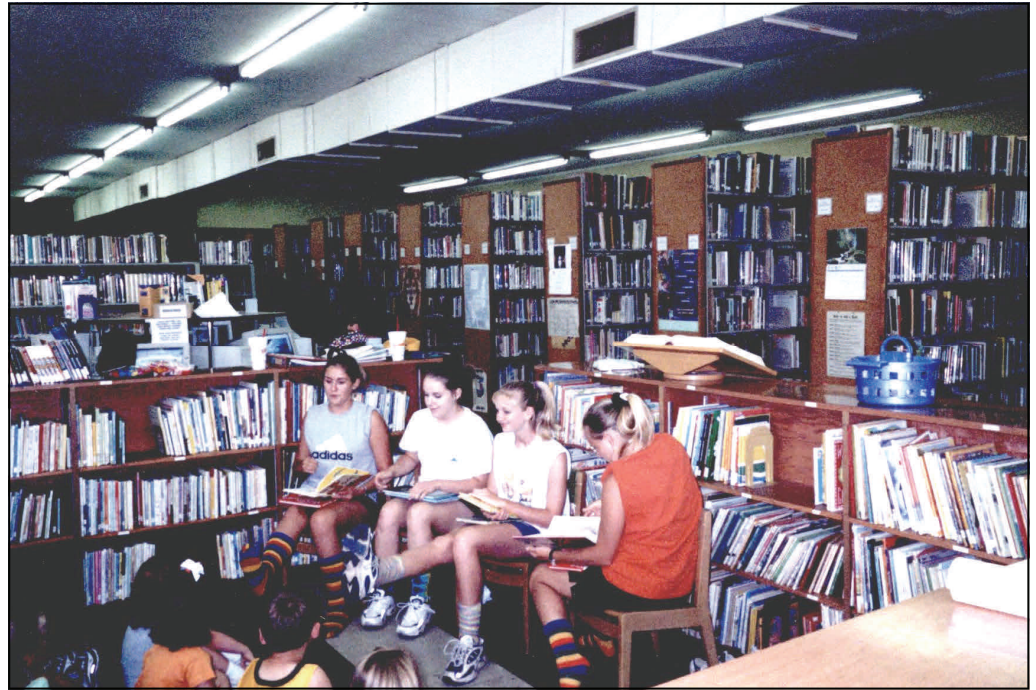
Above: In June 2001, local Girl Scouts read stories to children at the Dunklin County Library in Kennett. At the time, the library was located at 226 North Main Street. A few months after this photo was taken, the library moved across the street where it is currently located.